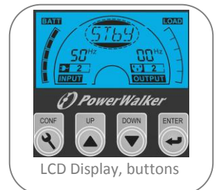
LCD Display, buttons